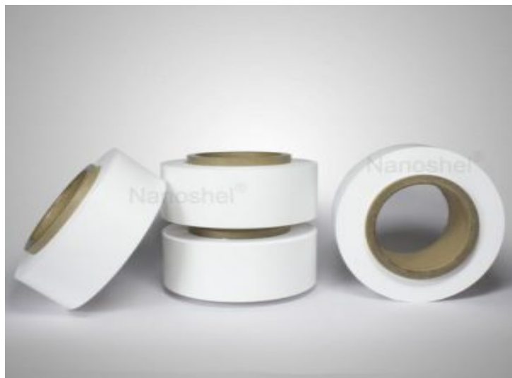
Battery PE Separator