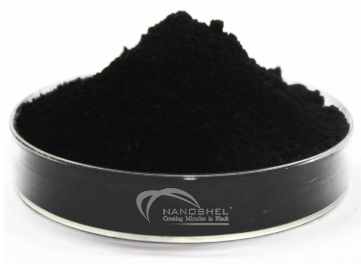
Multi Walled Carbon Nanotube