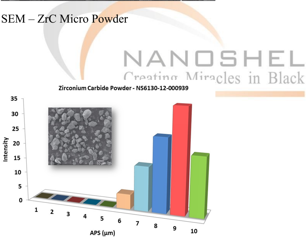
Particles Size Analysis – Zirconium Carbide Powder