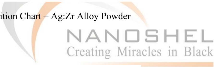
Silver Zirconium Alloy Powder - NS6130-05-587