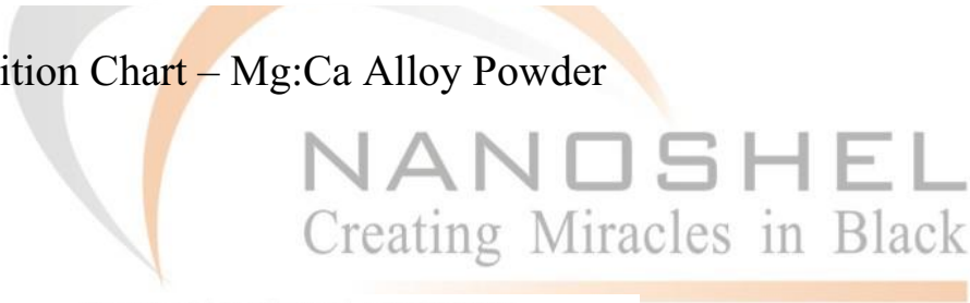
Magnesium Calcium Alloy Powder - NS6130-07-737