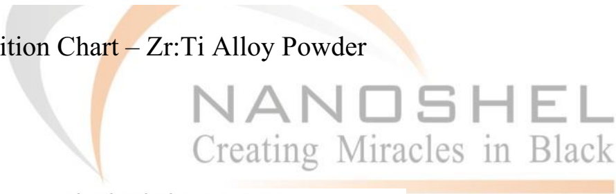
Zirconium Titanium Alloy Powder