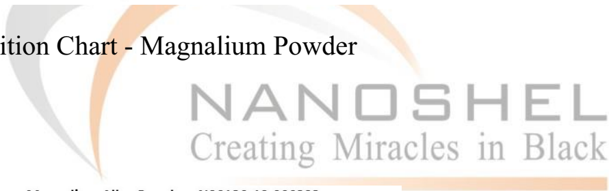
Magnalium Alloy Powder - NS6130-12-000323