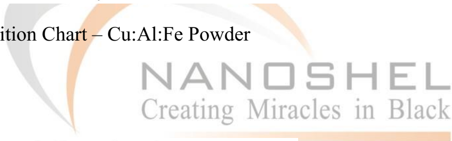
Copper Aluminium Iron Alloy Powder - NS6130-12-000910