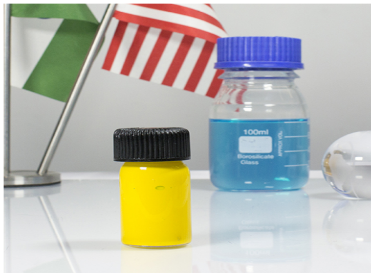
Organic Pigment Yellow 12