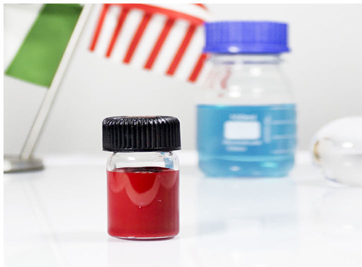
Organic Pigment Red 112