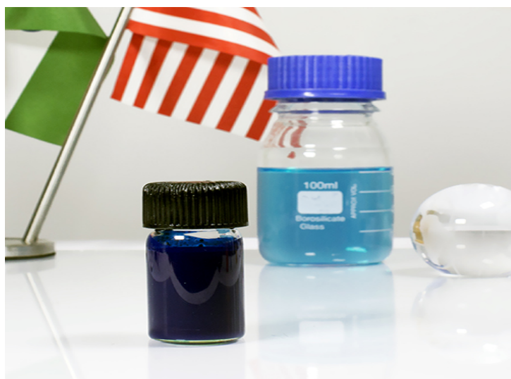
Organic Pigment Blue 15:0