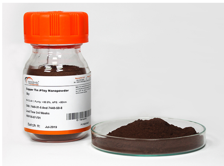
Copper Tin Alloy Nanopowder