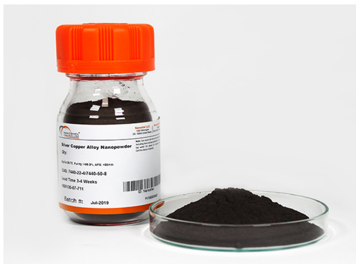
Copper Silver Alloy Nanopowder