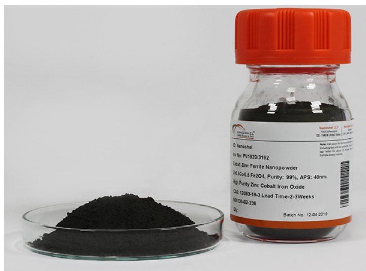
Cobalt Zinc Ferrite Nanopowder