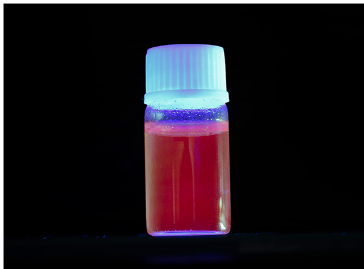
Red Carbon Dots