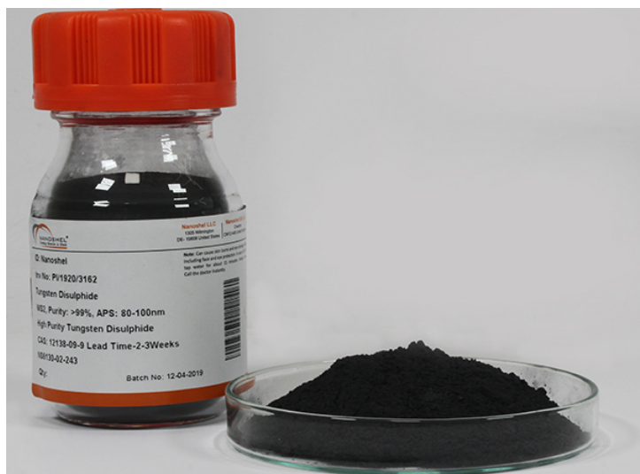
Tungsten Disulfide Nanopowder