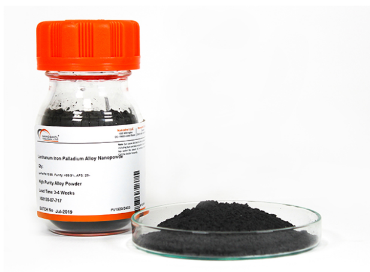
Lanthanum Iron Palladium Alloy Nanopowder