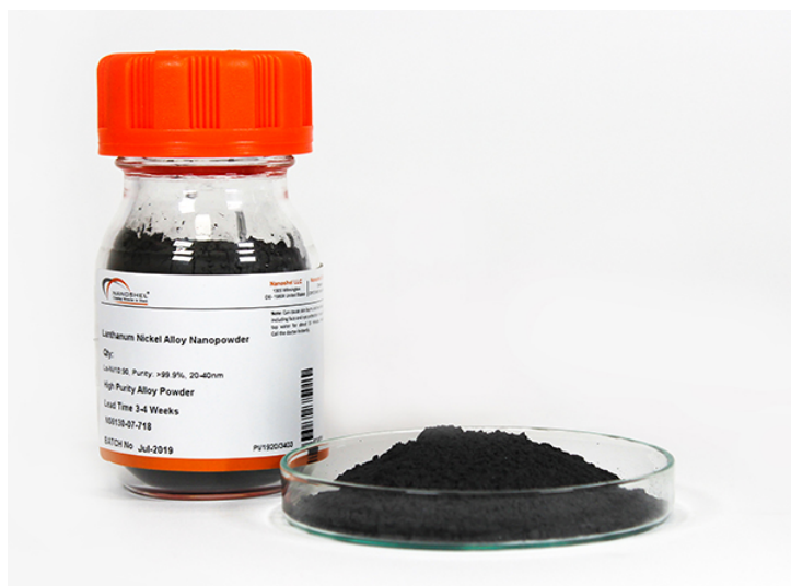
Lanthanum Nickel Alloy Nanopowder