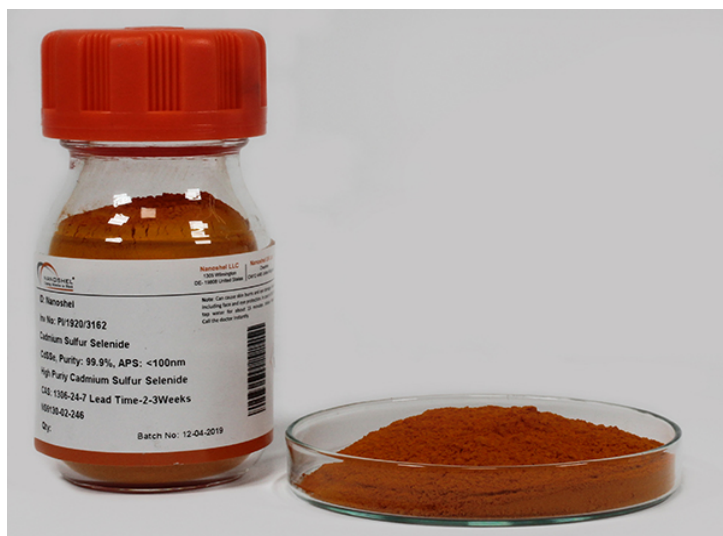
Cadmium Sulfide Selenide