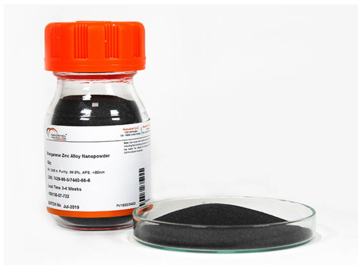
Manganese Zinc Alloy Nanopowder