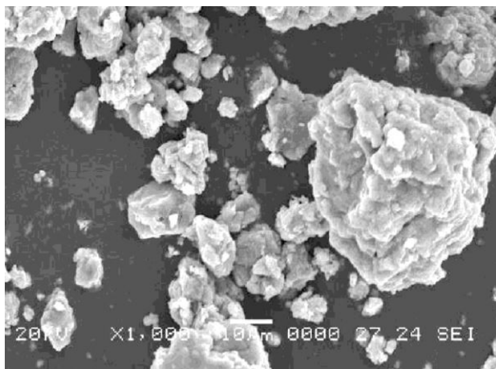
SEM – CdS Nanoparticles