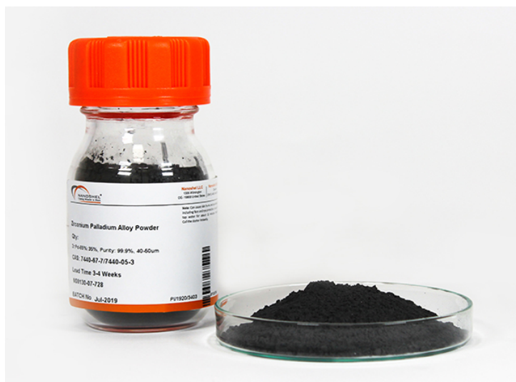
Zirconium Palladium Alloy Powder