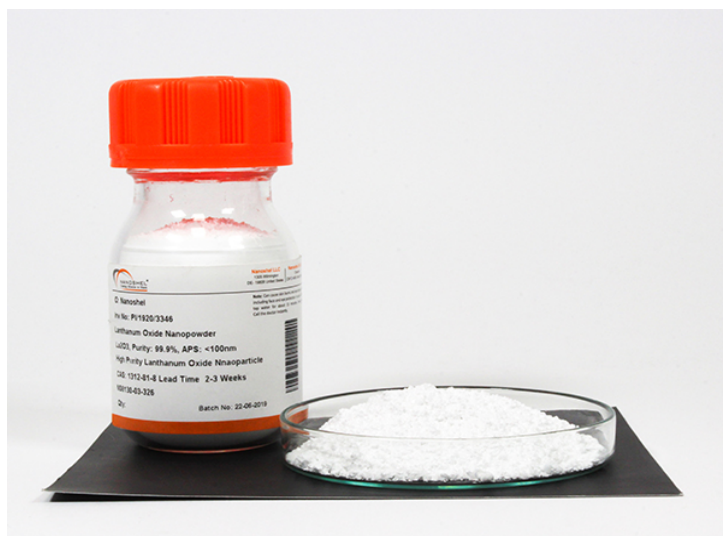
Lanthanum Oxide Nanopowder