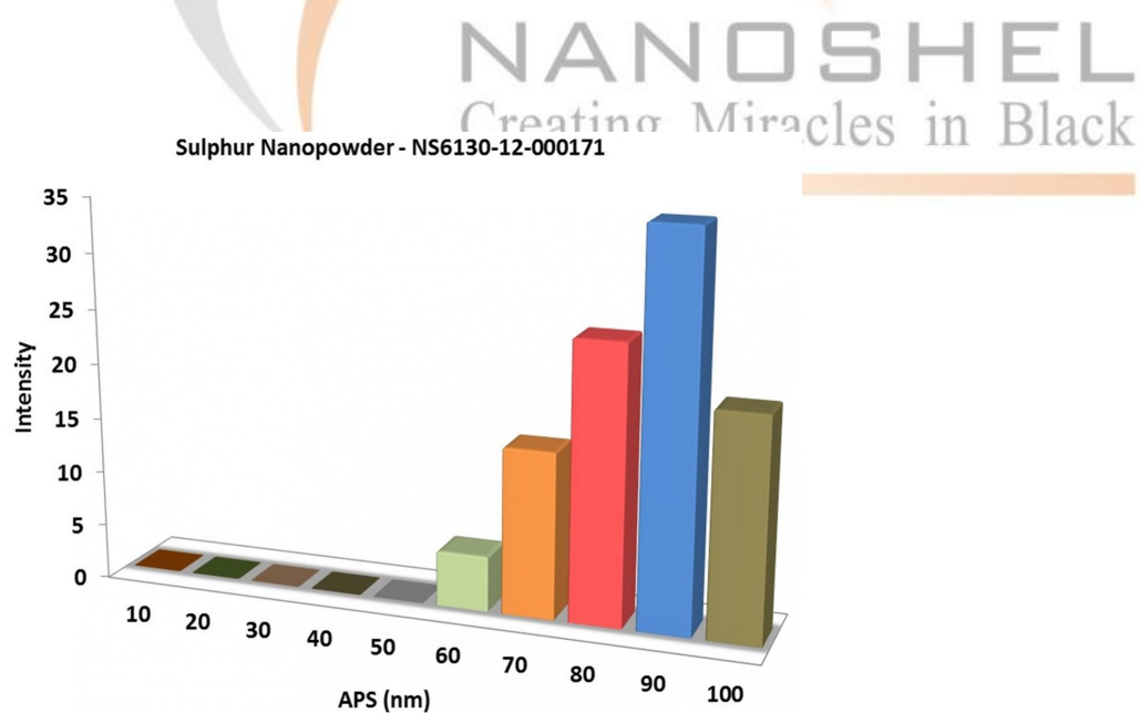
Particles Size Analysis - S Nanopowder