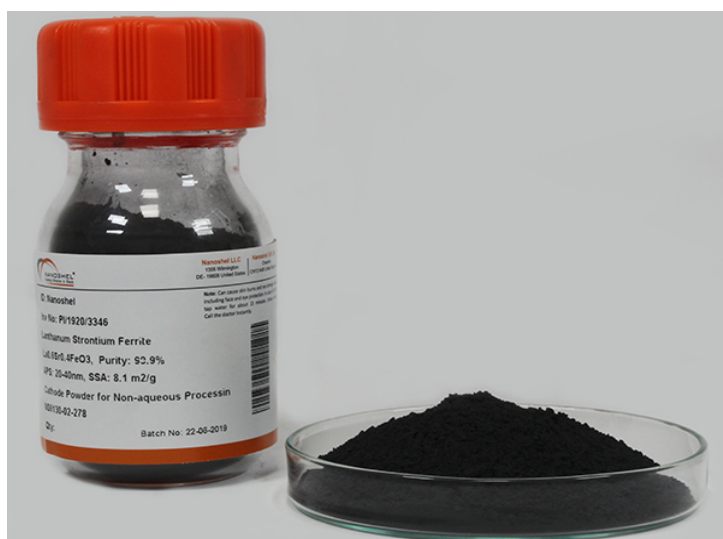
Lanthanum Strontium Magnetite