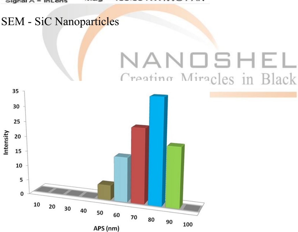
Particles Size Analysis