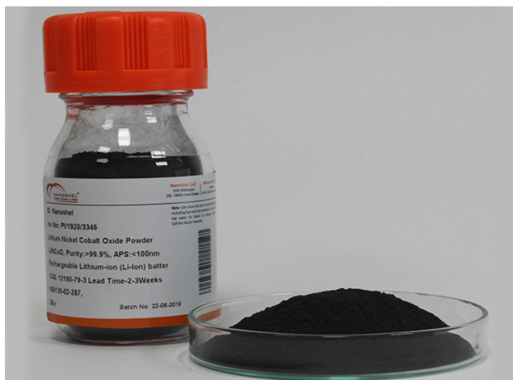
Lithium Nickel Cobalt Oxide