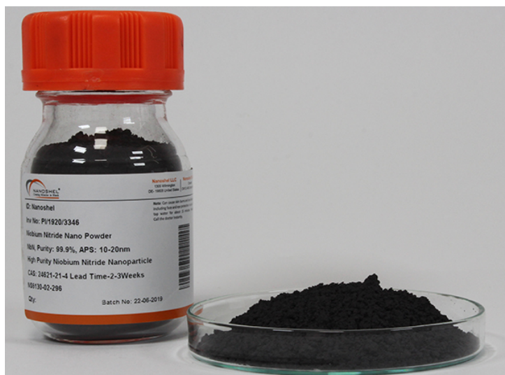
Niobium Nitride Nanopowder