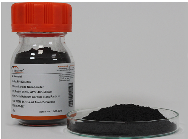
Hafnium Carbide Powder