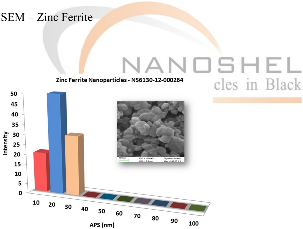
Particles Size Analysis – ZnFe 2 O 4 Nanopowder