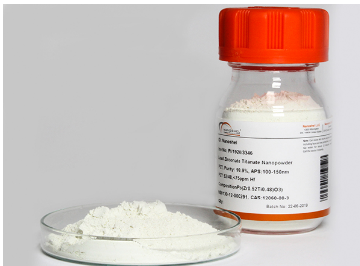
Lead Zirconate Titanate